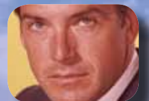
VAN WILLIAMS-82 ACTOR (The Green Hornet) Renal Failure