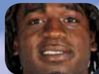
JOE MCKNIGHT-28 NFL PLAYER (Jets) Shot