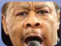
JOE LIGON-80 GOSPEL SINGER (Mighty Clouds of Joy)