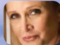
CARRIE FISHER-60 ACTRESS Heart Attack