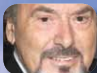
JOSEPH MASCOLO-87 ACTOR Alzheimer's Disease