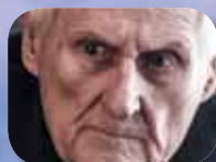
PETER VAUGHAN-93 ACTOR (Game of Thrones)