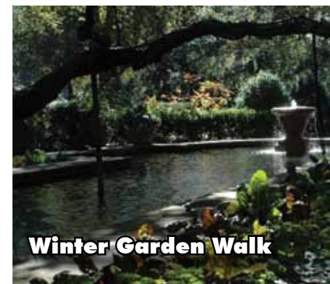
Winter Garden Walk

Bellingrath Gardens and Home is operated by the Bellingrath Gardens and Home Foundation, a charitable, not-for-profit organization. Bellingrath Gardens and Home is dedicated to the preservation and enhancement of the 65-acre garden and estate home of Walter and Bessie Bellingrath. For more information, visit www.bellingrath.org or call 251.973.2217. ♣