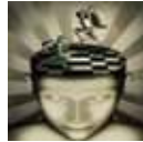
A.D. McKinley Featured Article: THE REAL ENEMY - THE INNER ME