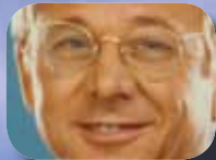
WILLIAM CHRISTOPHER-84 ACTOR (Mash) Non-Lung Small Cell Carcinoma