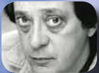
DON CALFA-76 ACTOR