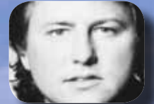
GREG LAKE-69 MUSICIAN (Emerson, Lake & Palmer) Cancer