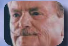
BERNARD FOX-89 ACTOR (Bewitched; The Mummy) Heart Failure