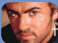
GEORGE MICHAEL-53 SINGER Heart Failure