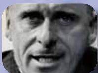
GORDIE TAPP-94 ENTERTAINER (Hee Haw)