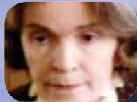
ALICE DRUMMOND-88 ACTRESS (Ghostbusters) Fall