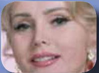
ZSA ZSA GABOR-99 ACTRESS Heart Attack