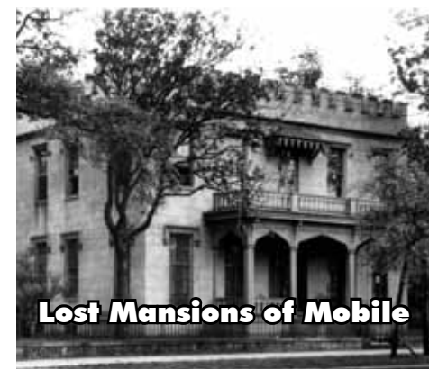
Lost Mansions of Mobile