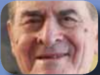
HENRY HEIMLICH-96 INVENTOR OF THE HEIMLICH MANEUVER Heart Attack